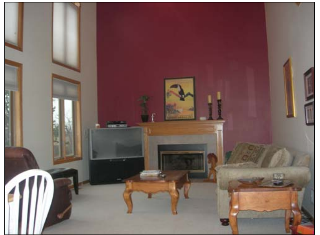
Two Story Family Rm w/ Fireplace