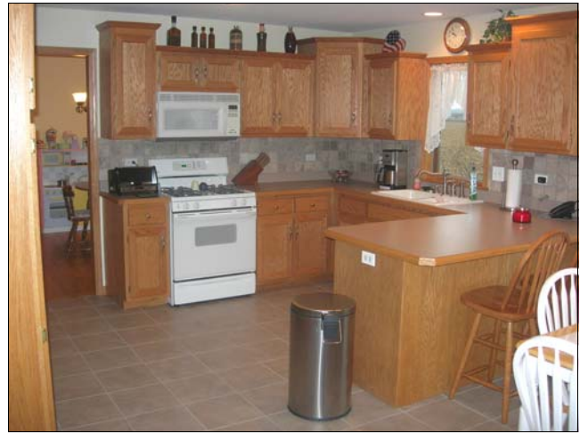
Tiled Floor & Stone Tiled Backsplash