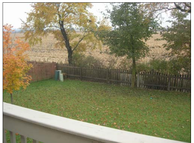
Private Fenced Rear Yard