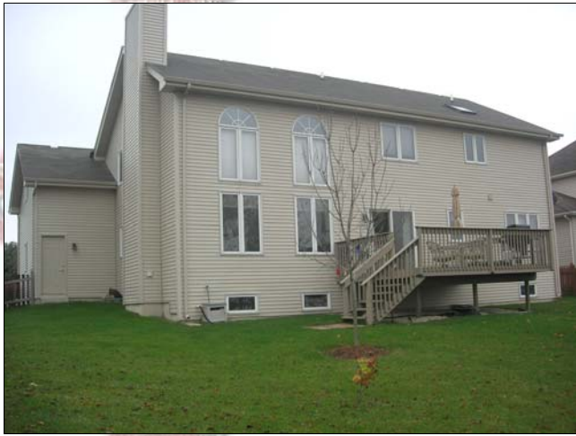
Rear Of Home Is Fenced & Has Lg. Deck