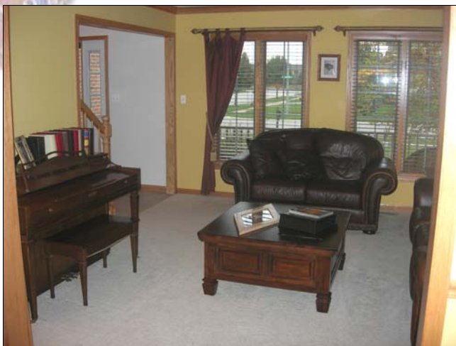
Formal Living Rm w/ Crown Molding