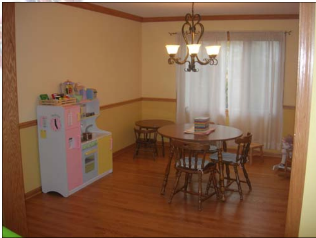
Formal Dining Rm w/ Hardwood Floor